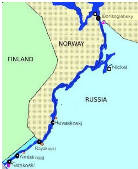
Fig.1. Layout of the sites of the Roshydromet federal monitoring network

Based on the Murmansk Roshydromet data, the highest levels of water pollution were observed in the area of the JSC Kola MMC activity (Monchegorsk, Zapolyarny and Nickel) and in the city of Murmansk. The Kolosjoki River in the Nickel settlement is the most polluted watercourse in the watershed basin. A characteristic feature of water objects located in the area of the Kola MMC activity is the presence of nickel and copper compounds in natural water (according to Roshydromet data). An analysis of the data obtained by Roshydromet from 2017 to 2020 (five-year period before the shutdown of the smelter in the Nickel