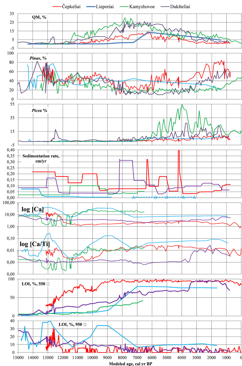
Fig.2. Preliminary results of selected data. QM – Quercetum mixtum (thermophilous pollen); Pinus – pine; Picea – spruce; LOI_{550} – loss-on-ignition when heating at 550° temperature; LOI_{950} – loss-on-ignition when heating at 950° temperature.

content of Ca/Ti increased simultaneously. Together with this, some carbonates could also be incorporated in sediments due to a high biogenic removal of CO_2 .